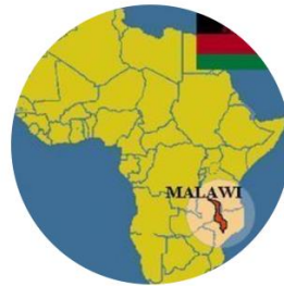
EVANGELICAL LUTHERAN CHURCH IN MALAWI, AFRICA