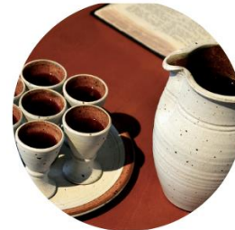
FULL COMMUNION PARTNERS