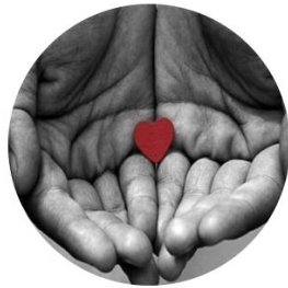
HEALTH & HUMAN SERVICES